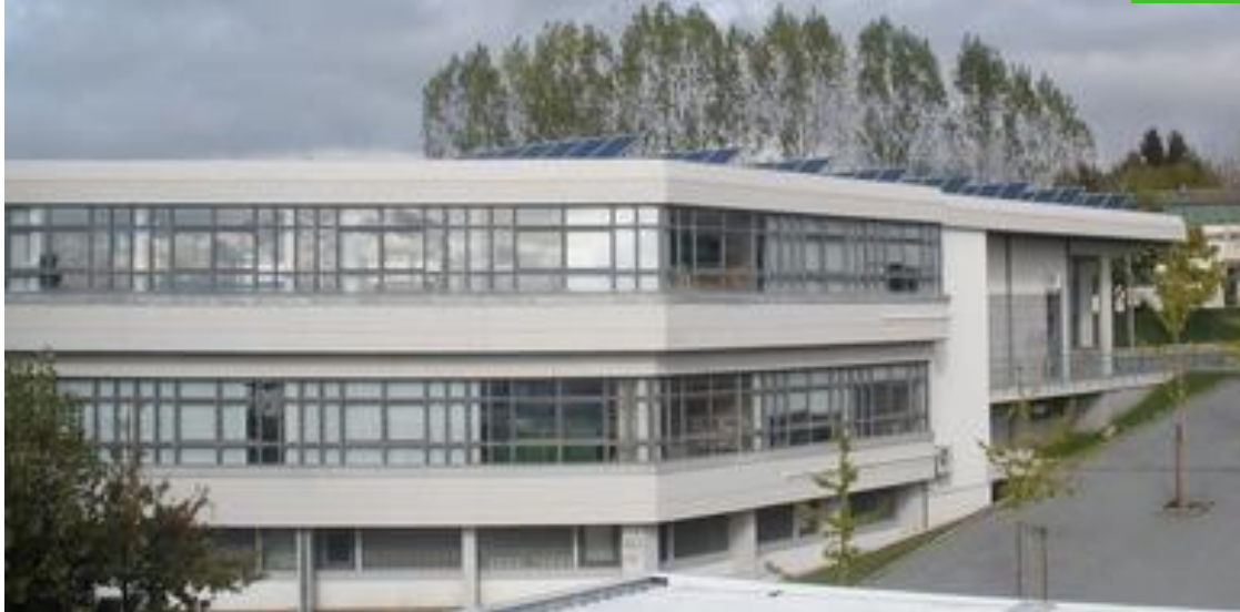
Library – 20 kW