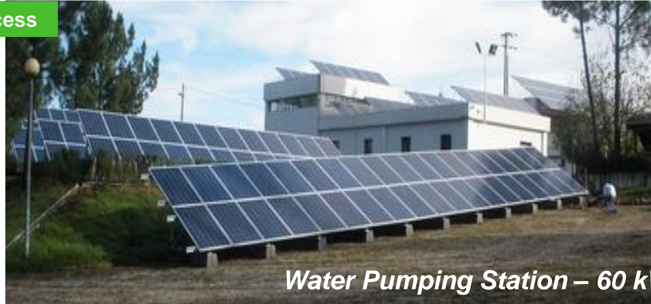
Water Pumping Station – 60 kW